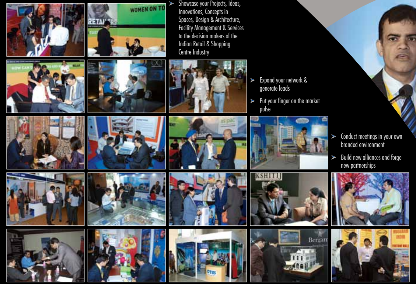
Exhibitors over the years